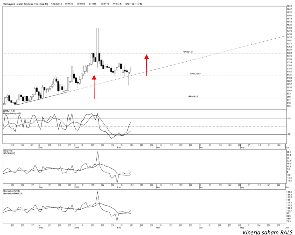
Kinerja saham RALS